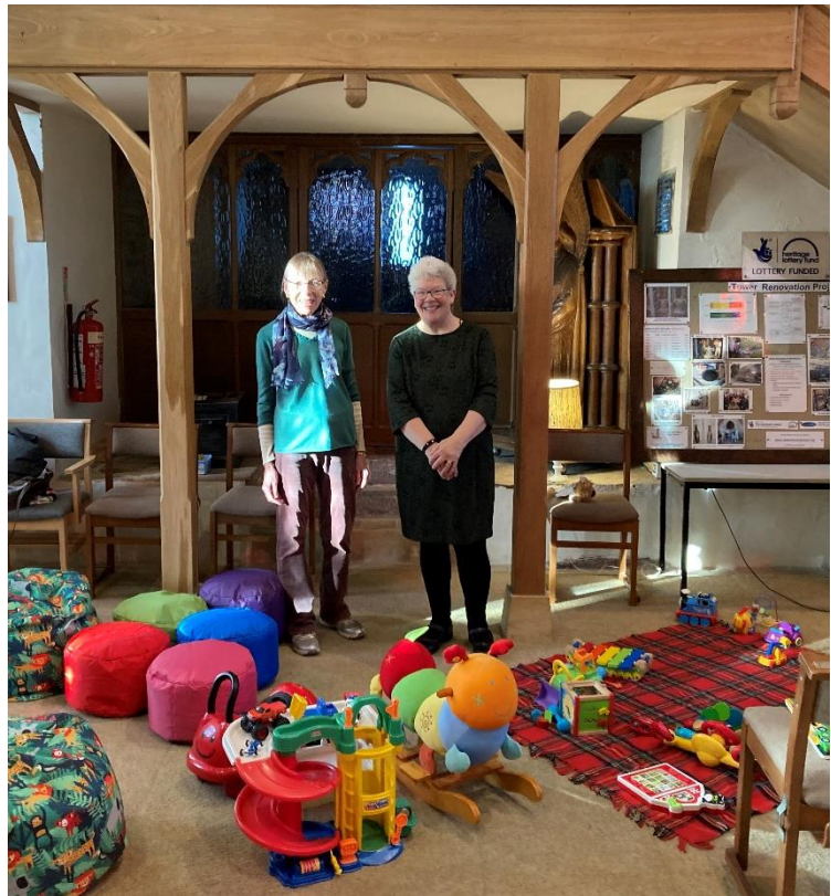
Ready for the Little Stars!