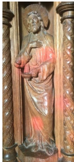
"I AM the Light of the world."

In May, Western Steeplejacks repaired cracks in the stone parapet on the south east corner of the tower, beside the flagpole; the cracks were stitched with stainless steel tie bars, the work being paid for by the Friends of St. Peter's. At the same time the lightning conductor system was tested, the old flagpole was removed and lowered to the ground, and its corroded iron fixing brackets were removed from the stonework. The flagpole has since been replaced with a new one, again paid for by the Friends of St. Peter's, which will be recorded in the 2022 fabric report.