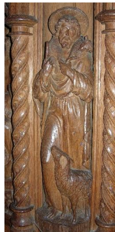
"I AM the Good Shepherd."