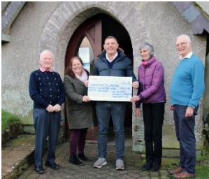
Presentation in January on behalf of the 2021 Christmas Tree Festival to Dartmouth Caring.