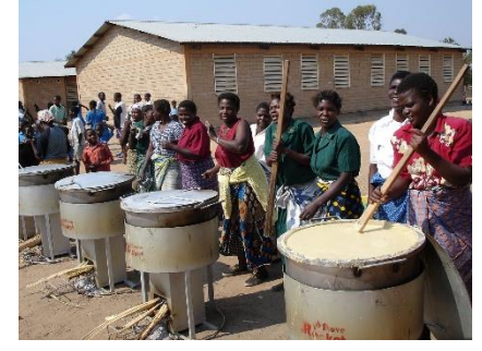
Volunteers preparing Mary's Meals in Malawi.

wide variety of needs) and, a new addition this year, Mary's Meals (a wonderfully focused and effective charity organizing free meals for children in poor countries in their schools, meals cooked by local volunteers with local produce as far as possible). St Peter's also supported Stoke Fleming Christmas with a substantial contribution.