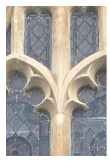
One of the north side windows showing the work done on the stone mullions.