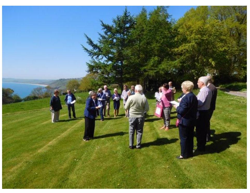
Perfect weather for the Annual Rogation Service.